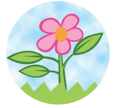
a flower in the garden.