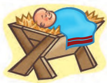
Jesus was born