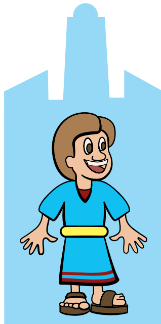
Jesus visited the temple when he was 12 years old.