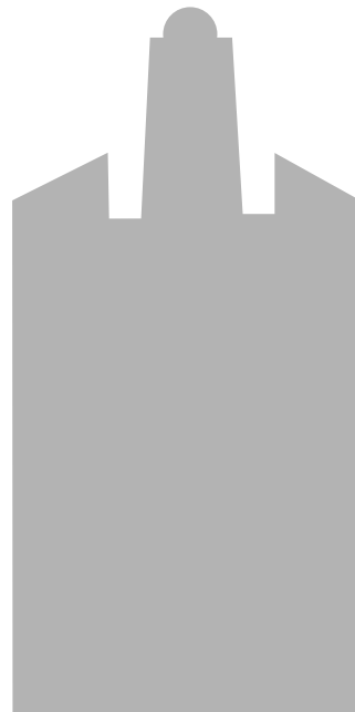
Jesus visited the temple when he was 12 years old.